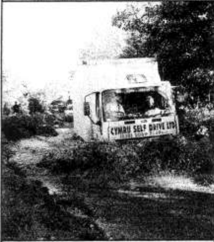
Into the unknown with a river crossing

Kosova is a beautiful country surrounded by mountains. The people are warm, friendly and very welcoming. Everyone was so grateful for the aid we were able to give them. It was very emotive seeing the conditions the Kosovars live under - shelled and burnt out houses, families living in tents or making habitable one room of a house being rebuilt, seeing roadside shrines where massacres had occurred and hearing first hand from the people their personal stories. So many of the people we worked closely with had suffered terribly. We admired them for the courage they had shown, for the resilience and fortitude they now show, by pulling their lives together, helping others rebuilding their homes and lives. They set an example to all of us.