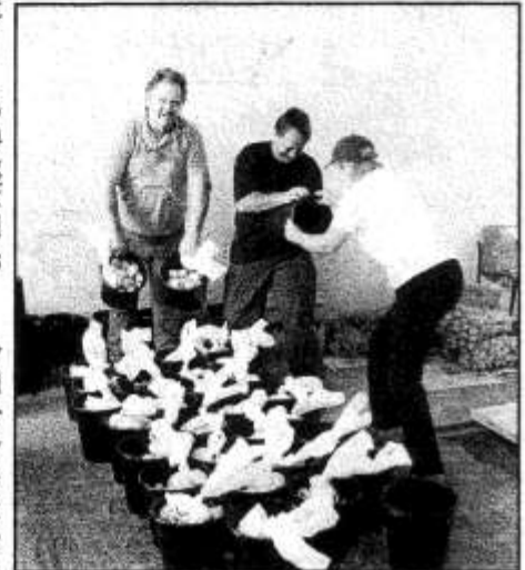
Making up food distribution packs