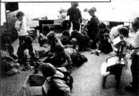
Happy children at Kindergarten play with donated toys