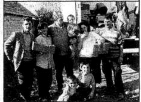
Kosovo families receiving aid packages

For further information and more pictures, visit the Hope and Aid Direct website. http://www.hopeandaiddirect.org.uk/ We also have a presentation available on CD.